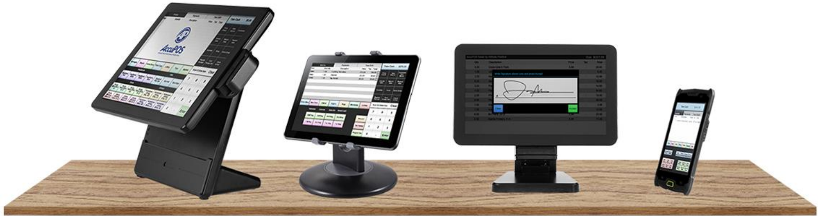
Touch Screen PC POS